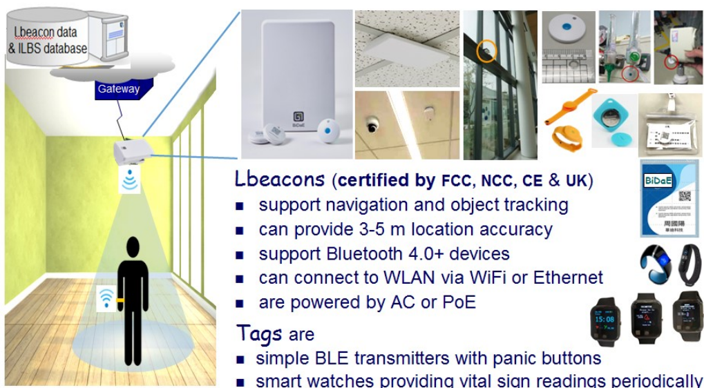
Figure 2 Lbeacons and tags

Again the work done by BPS is carried out collaboratively by two types of components: They are tags and Lbeacons as illustrated by Figure 2.